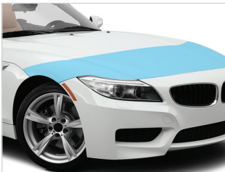
Partial Hood and Fender

Clear gloss polyurethane for stone chip protection, high wear, and abrasion in the automotive, motorcycle, RV, powersports, bicycle, aircraft, and other transportation markets.