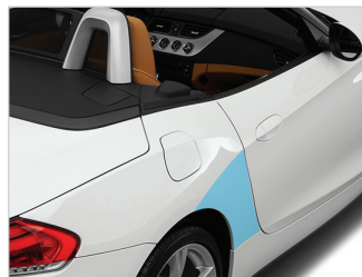
Rear Quarter Panels